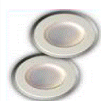
Application of Supine Patch

Company Profile: The company was founded in November 2017 and has a pending local patent and PTC application related to a hydrogel. It has already received KRW 100 million worth of private investment. The company received an award from the Ministry of SMEs and Startups and was selected for the Tech Incubator Program for Startups. It also won a prize for excellence at the Hyundai Heavy Industries technology competition.