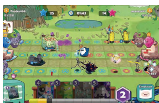
Real-time strategy composed of different units and summoning methods