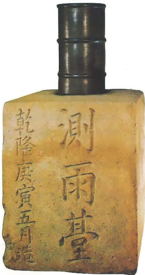
A Chugugi model from 1770

Source: Excerpt from "Fifty Wonders of Korea" Vol. 2 Science and Technology, Korean Spirit & Culture Promotion Project