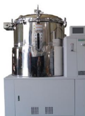
Microbial cultivation system