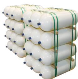
NGV fuel tanks type 1