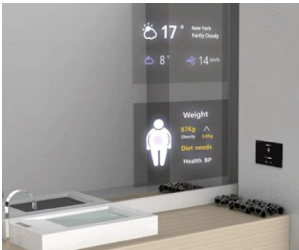
Smart Home Mirror Information Display