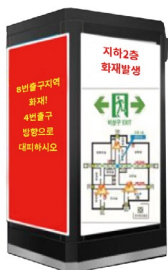
IoT digital signage