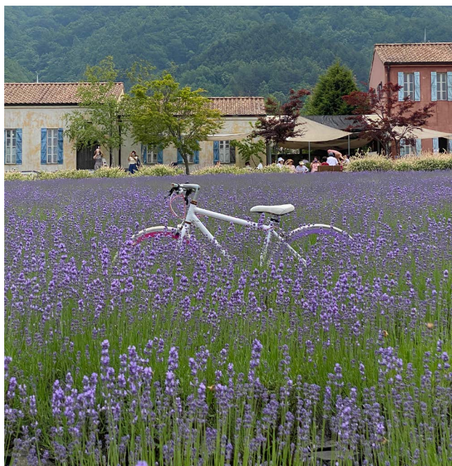
Hani Lavender Farm in Goseong-gun County

Goseong-gun offers more enjoyment in addition to its beachside and port destinations. Away from the beach and inland on Seoraksan Mountain is a village filled with lavender. Hani Lavender Farm, a 20-minute drive from the car campgrounds, is an aromatic haven for bees. Sunflowers, herb, chamomile and metasequoia fill the photogenic flora in addition to lavender.