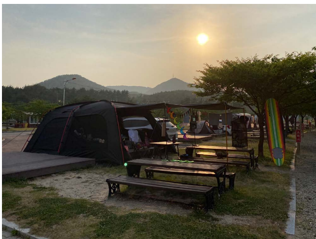
Songjiho Auto Camping Resort is famous for clear waters, pristine sand and a lookout spot for migratory birds.

Adjacent to the walk trail is Goseong Wanggok Village, which was founded in the 14th century and retains the southern traditional style of Hanok and thatched-roof houses in their original structures. Seeing them gives the impression of being transported 600 years back in time. Water lilies adorn the pond in summertime, while traditional thatch and tile-roofed houses display old components like crock roofs, gateless gardens, stables and rafters. The village can hold up to 50 households, of which 40 are occupied with residents. Treadmills, rice mills, traditional confectionary production, seesaws and swings are also