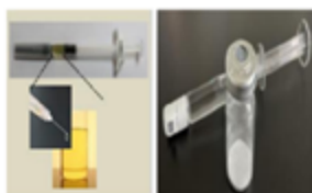
1-month lasting diabetes and obesity treatment