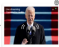
Translation of Voice into Text/live subtitles/meeting interpretations