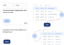
Text subtitles translation