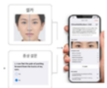
Predicting and monitoring thyroid eye disease risk levels