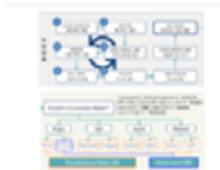
High-level/advanced feature extraction process