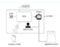
Compression vest for children With developmental Disabilities