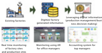
CPS (Cyber Physical System) Integrated Control Solution