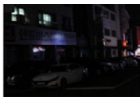
Before the application of the technology